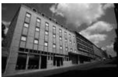
Main building in Porto

formation of in-house, full-time, skilled staff, and the development of editing software for dictionary making, using available computer technologies. It took a few years before the work done in the dictionary division became almost completely automated: dictionaries were converted into databases, information was gathered and tagged so as to permit data retrieval, and there was a huge investment in electronic devices for storing information and optimizing the productive process. We were very happy to produce our first dictionaries coming directly out of our database in 1998, and we took the opportunity to redesign the cover and change the format, while maintaining